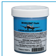
70307-L (4 oz - 113 g)