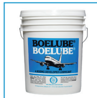
70307-05 (35 lb - 16 kg)