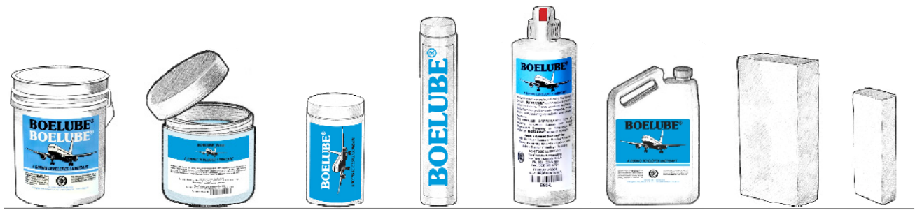
5 Gallon Pail (18.9 liter)